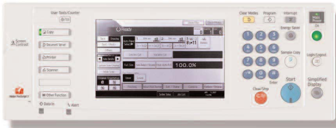
The large, backlit, easy-to-read control panel puts extensive capabilities at your fingertips.

Saving space is great. Saving time is even better. Improve turnaround time when you output documents at a quick 4 or 6 D-size prints-per-minute—a mere fraction of the time it would take a traditional wide format ink jet plotter or analog copier to produce a single document.