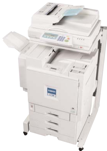
IS300e Scanner shown with the CLP35 D Color Printer and optional Scanner Table.

TWAIN capability allows you to capture hardcopy images in digital form for further editing back at the host PC, for incorporation into various TWAIN-compliant software applications, or to save for future use.