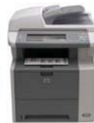
HP LaserJet M3027x MFP (CC479A)

All the features of the base model, plus: