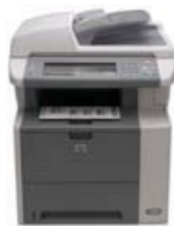
HP LaserJet M3027 MFP (CC478A)