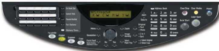
Set up print, copy, scan and fax* jobs in seconds with the intuitive control panel.

The speed of laser. The convenience of inkjet. All-in-one capabilities. And the vivid business color of GelSprinter™ technology. Now you can have it all with the SAVIN® GX3000s/GX3000sF/GX3050sFN desktop color MFPs. These three incredibly cost-effective systems bring all the advantages of full-color performance to small offices and workgroups — in a flexible design that boosts your personal productivity.