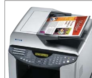
Handle any task — including full-color scanning and faxing* — with a single system.